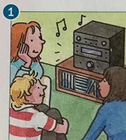
listen to music