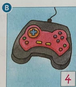
a good game