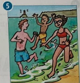
go to the beach